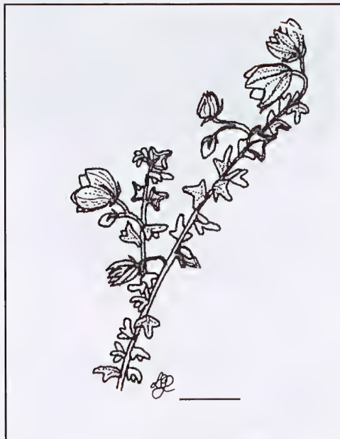
Figure 4. Guichenotia apetala A.S.George – flowering branchlet. From C. Wilkins 419. Scale bar = 1 cm.